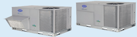
Light Commercial RTUs

One option: Install an OEM or retrofit Economizer feature on your packaged rooftop unit(s), and enjoy the money-saving benefits of free cooling while introducing more fresh air into your learning spaces.